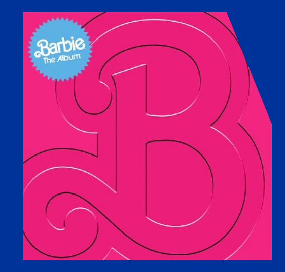
BARBIE THE ALBUM

Scored a #1 on Billboard's Country Airplay with 'Angels (Don't Always Have Wings)'